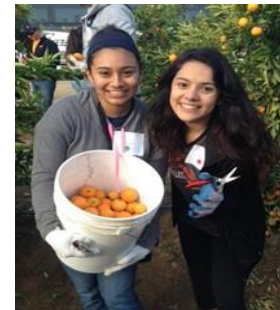
Volunteers Gleaning Homeowner's Fruit

Food to Share will combat hunger and increase access to healthy food in underserved neighborhoods that are represented by high concentrations of poverty and communities of color.